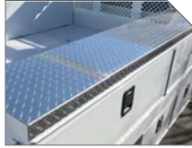
ALUMINUM TREAD PLATE TRIM