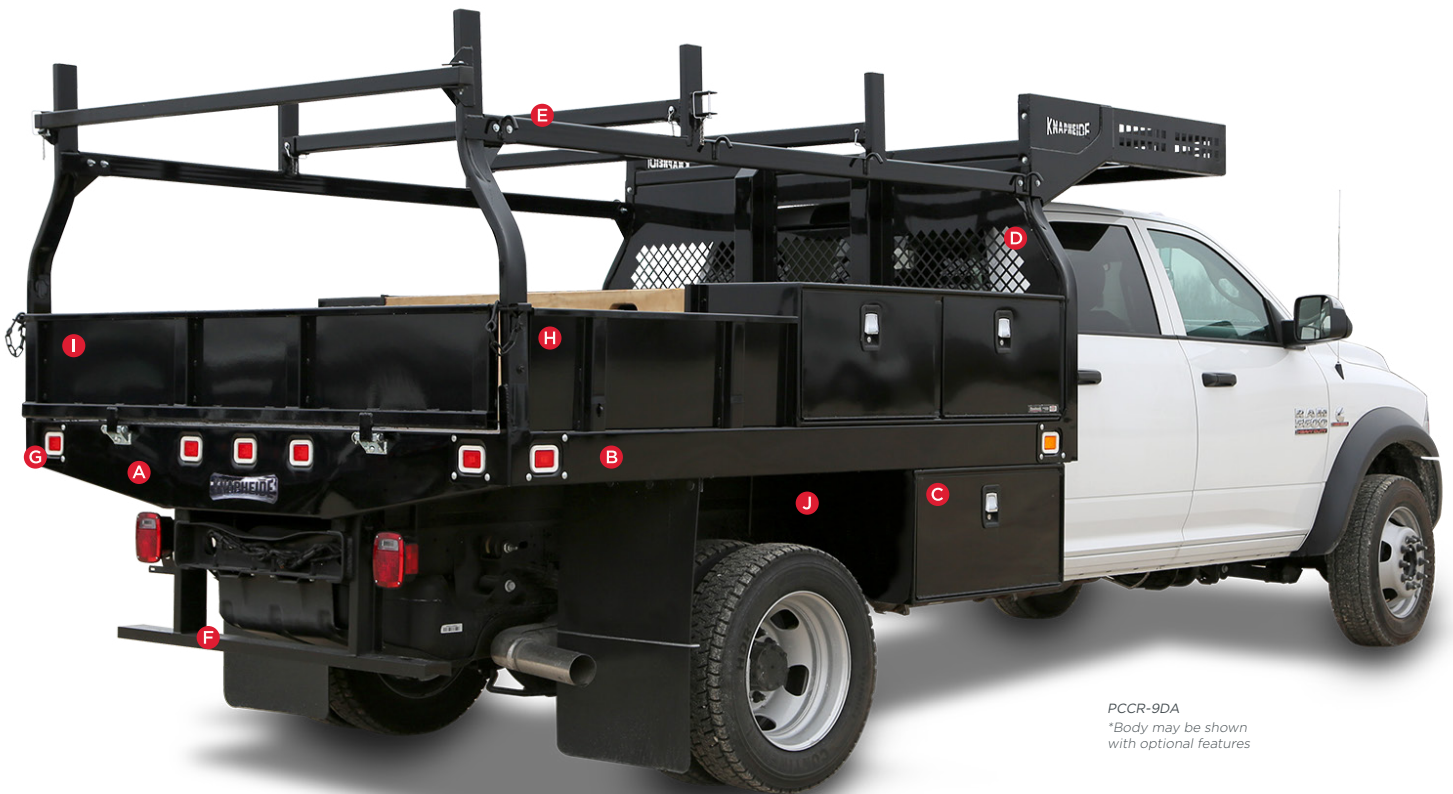
PCCR-9DA *Body may be shown with optional features

The Knapheide Concrete Body has everything a concrete contractor needs in a work truck. This rugged truck body gives you a multi-functional material rack, ample hauling space, secure storage and a fold-down tailgate for cargo access.