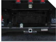
8' UNDERBODY STORAGE COMPARTMENT